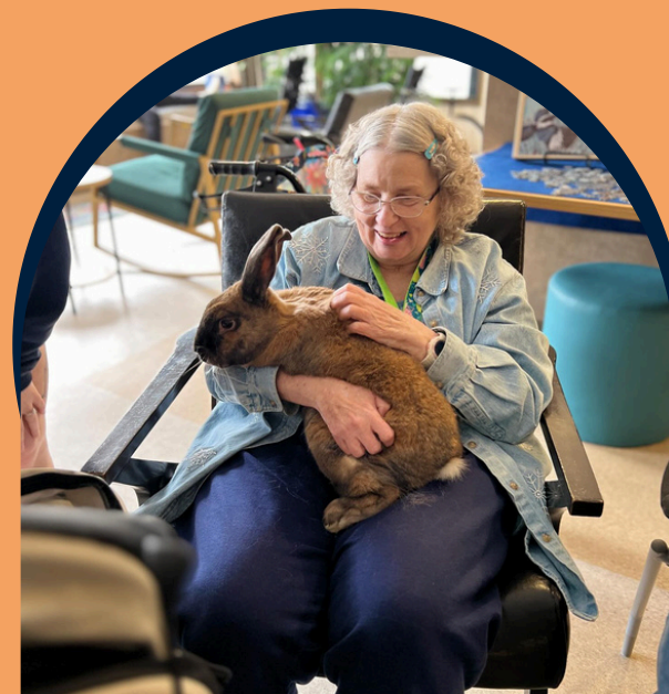
For Assisted-Care Facilities